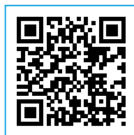
Former Archbishop of York, John Sentamu: Pray for 5.