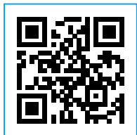
A Wave of Prayer Across the Nations. Mothers Union, Coventry

There are some great examples shown in the videos below including interactive and creative prayer activities that are great for all the family. Why consider hosting a community fun day and provide activities such as face painting, bouncy castles and kite flying alongside prayer activities. Here are some examples: