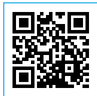
A Wave of Prayer Across the Nations. Burnley