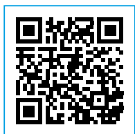
Day 10 ‘Silence’ Members of the Community of St Anselm

Many people including churches have participated in silent prayer, holding up their loved ones who have yet to know Christ, before God in silence. If you are new to silent prayer or would like to know more about this practice – watch these videos: